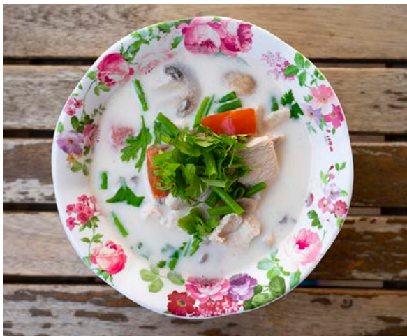
Tom Kha Coconut Soup