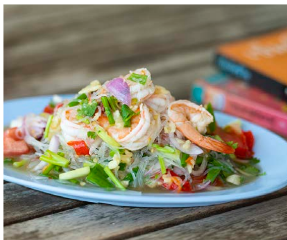
Glass Noodle Salad