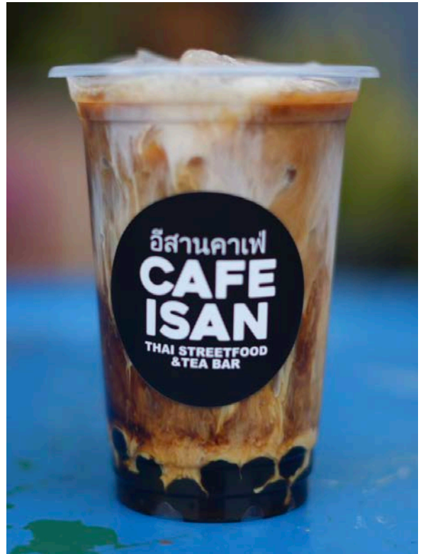
Thai Iced Coffee (with Bubbles)