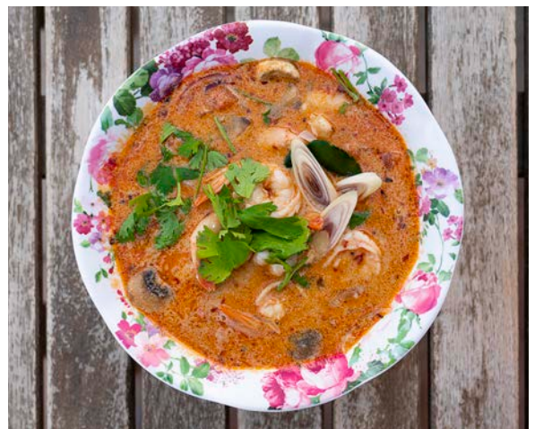
Tom Yum Soup