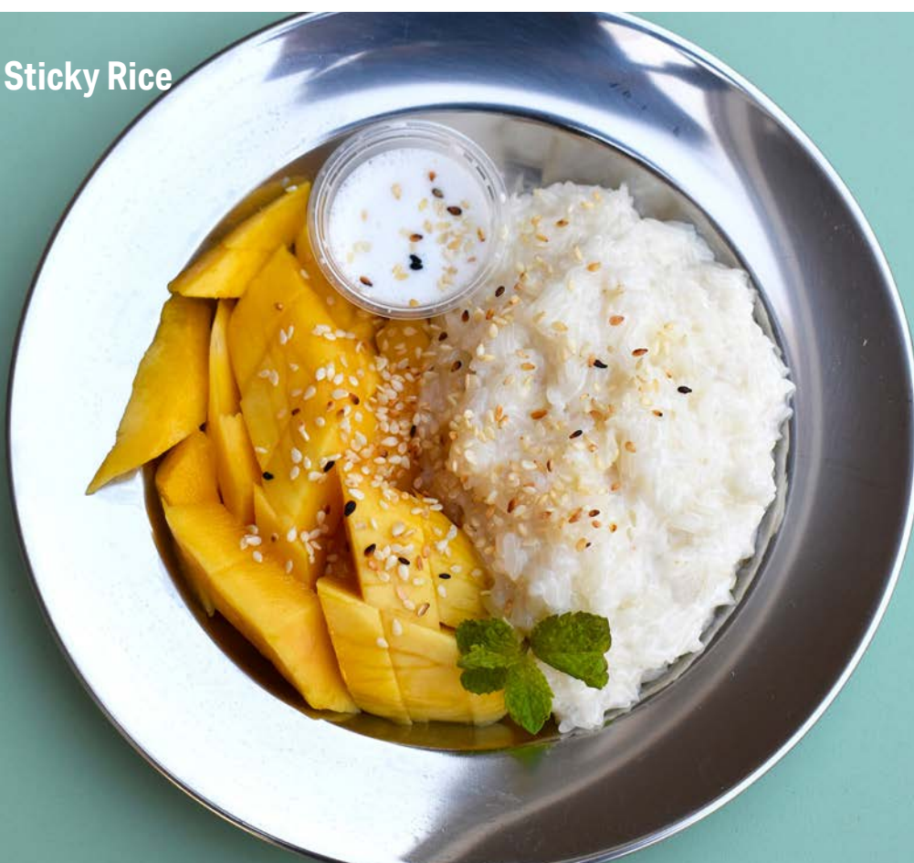
Mango & Sticky Rice