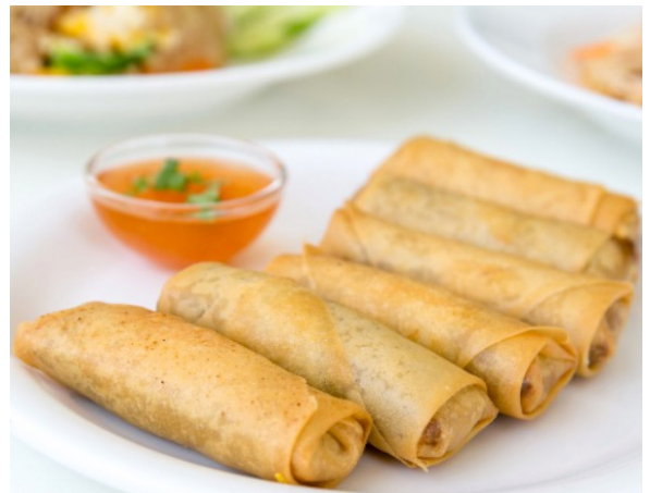
Veg Spring Rolls

ถ้าคุณต้องการ กุ้งแช่น้ำปลา ส้มตำปลา ร้า ซุปหน่อไม้ ส้มตำปูม้า สามารถแจ้งพนักงานได้ค่ะ